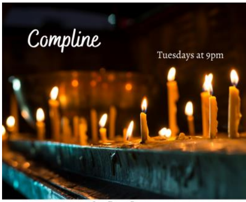
In a Zoom Room Link shared in e-news and our Parishioner Facebook Group